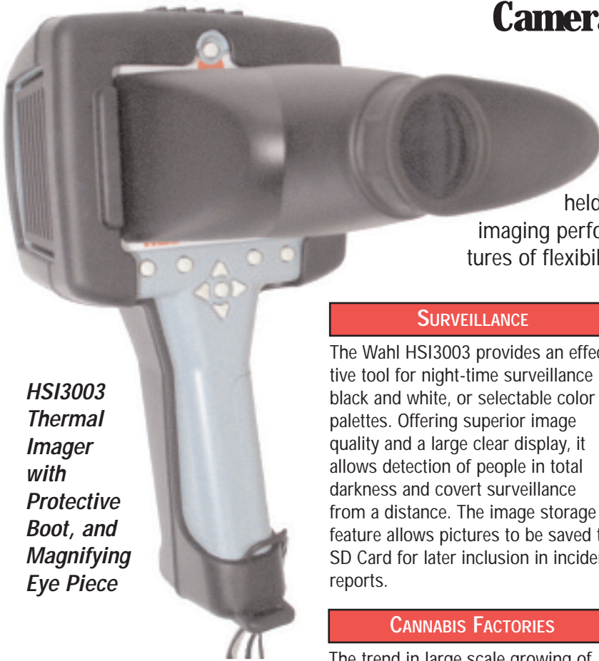
HSI3003 Thermal Imager with Protective Boot, and Magnifying Eye Piece