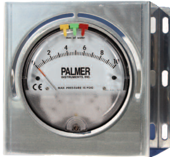
Aero Type Gauge shown with optional J-299 Surface Mount Bracket.

Specifications subject to change without notice.