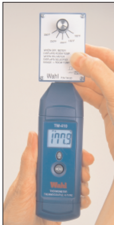
TM410 shown in use with the TA50AFK Calibrator

The Wahl TM410 Type K Thermocouple Digital Heat Prober® Thermometer provides the highest accuracy at the lowest price of any Thermocouple Instrument on the market today.