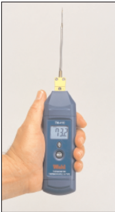
TM410 with TP-100 Probe