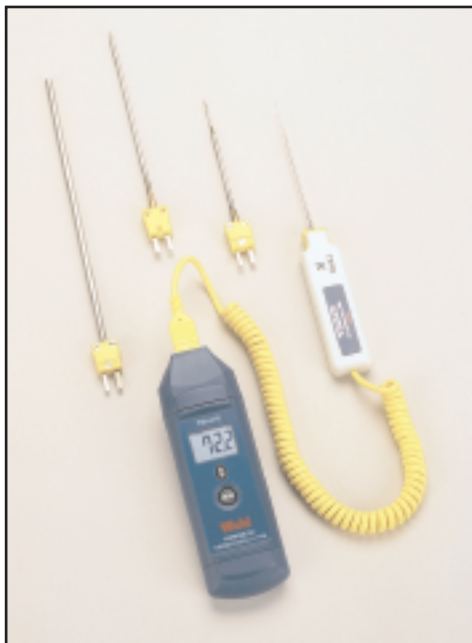
TM410 with TCL329K Extension handle and various probes

TCL329K Extension Handle allows use of interchangeable probes with one handle and cord set. This economical and compact Type K Probe System is usable with the Wahl TM410 Thermocouple meter.