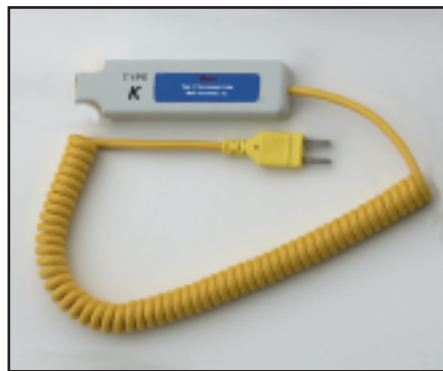
TCL329K Extension handle

Accuracy is maintained regardless of which probe is attached, assuring greater certainty of safe food temperature, and tighter control over the quality of the finished product.