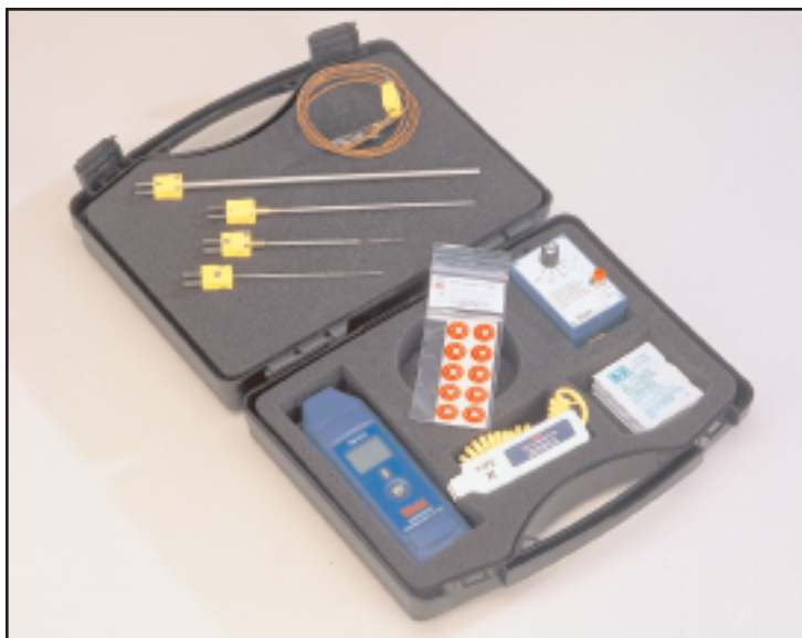
Custom TM410 Food Service Kit shown with optional accessories: TA50AFK Calibrator, TCL329K Extension Handle, Type K Probes, Temp-Plate® Temperature Labels and cleansing wipes (not included).

Customize Your TM410 - Food Service Kit to ensure your HACCP program maintains the most stringent standards, at the lowest cost.